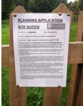
Manor Hall Farm