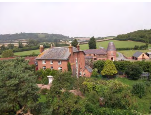
Views from the