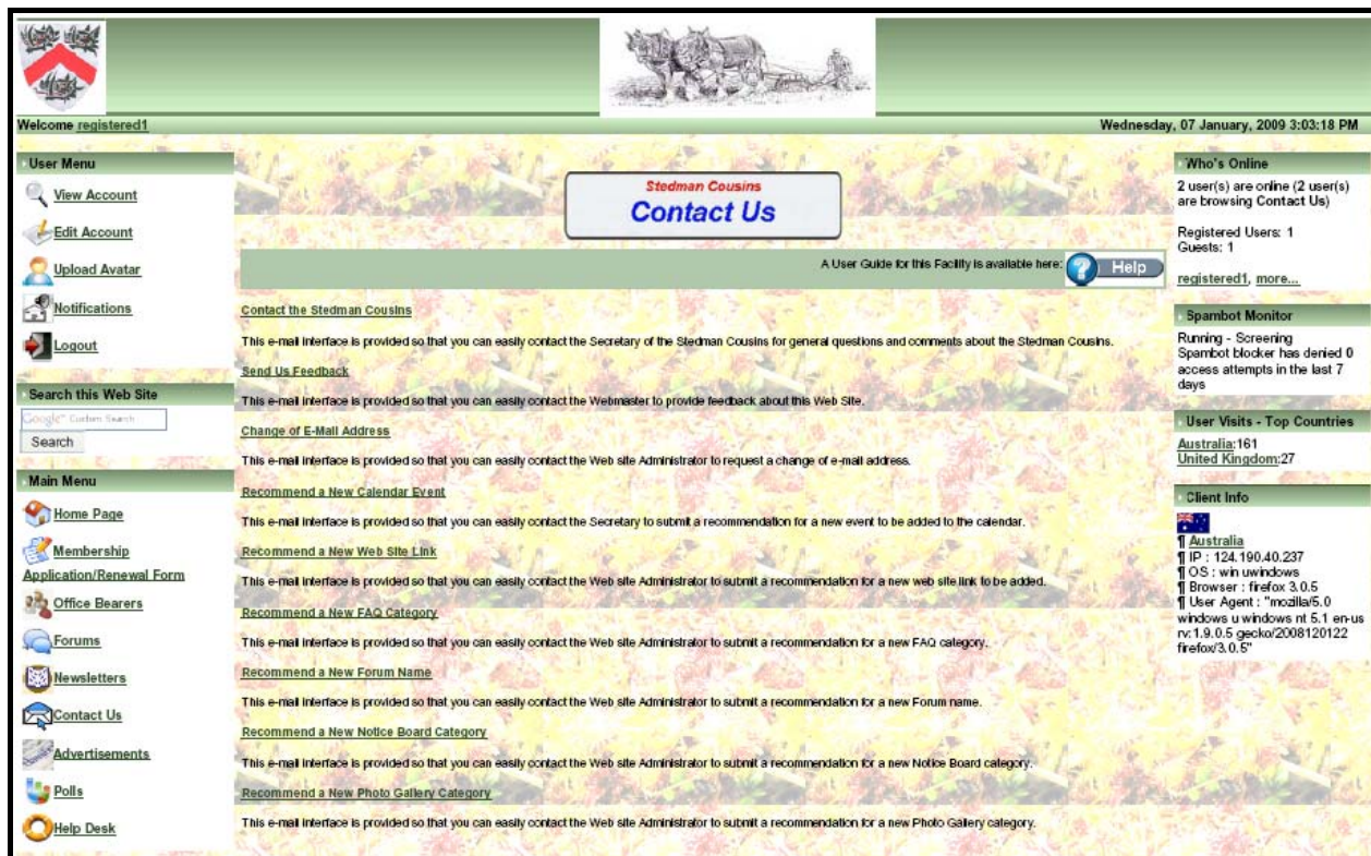
Figure 2: Sample Contact Us Page - Registered Users